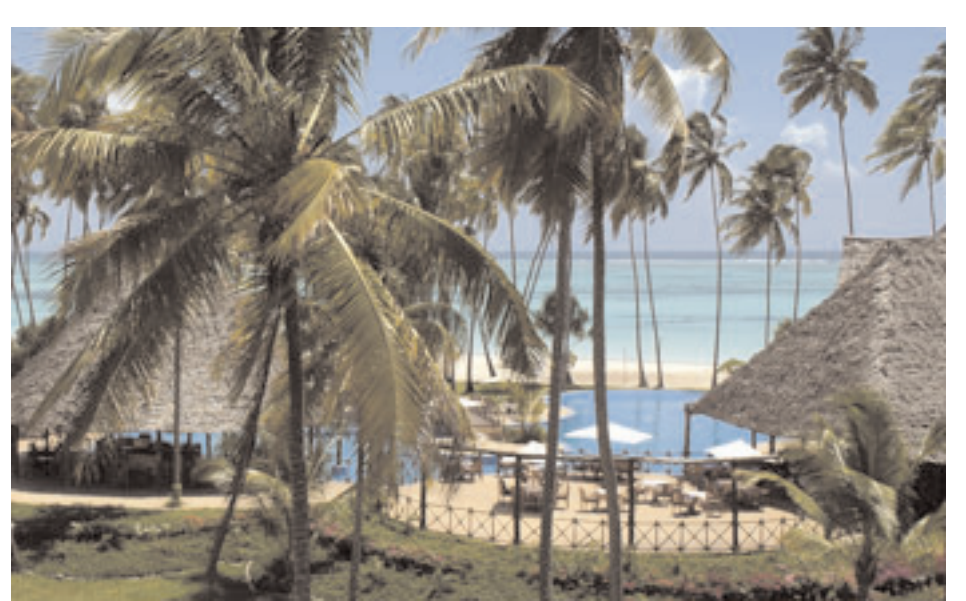
5♥ Cheetah Safari, Kenya & 4♥ Ocean Paradise, Zanzibar