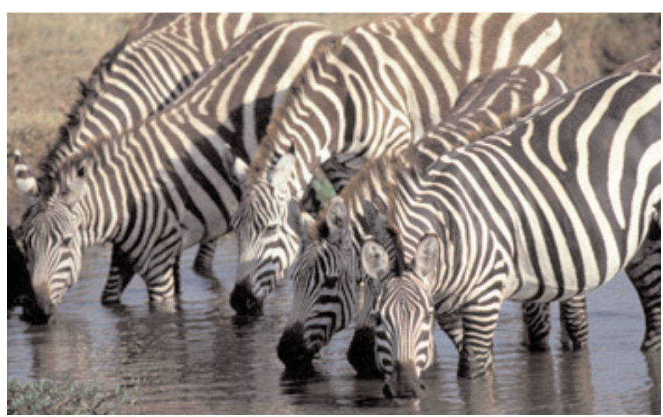
3☆ Thorn Tree Safari & 3☆ Travellers Beach, Kenya