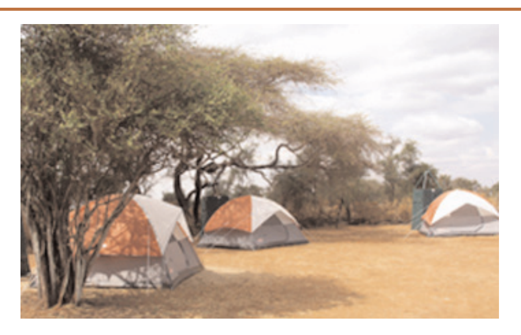
Adventure Camping Safari, Kenya

Below is a selection of safari and beach holidays in October you can choose from and perhaps witness this incredible spectacle!