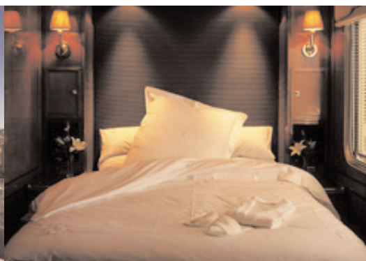
Double Suite, Blue Train