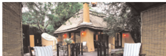
Jock Safari Lodge