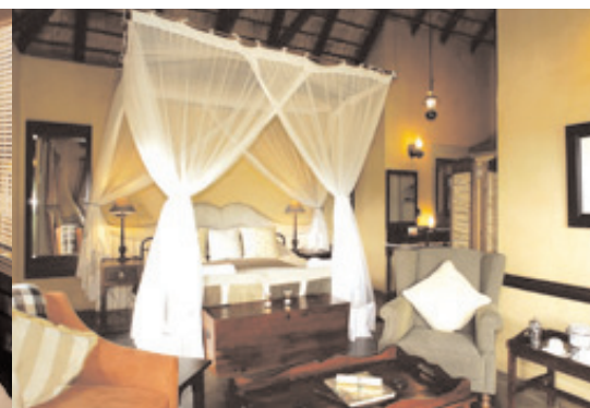
Jock Safari Lodge

Terms and conditions apply – subject to availability.